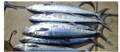
Figure 1.1 Kingfish ( Scomberomorus commerson ) caught in the sea waters of the United Arab Emirates.

THE NARROW-BARRED SPANISH MACKEREL Scomberomorus commerson is perhaps the most important of the region's highly migratory species. Greatly prized for human consumption and known locally as the kingfish or by its Arabic name of kanad, it is pursued by both commercial and recreational fishermen. Widespread through the Indo-Pacific region, it is well known in Australia, South Africa and north to the Arabian Gulf. Kingfish are representative of a so-called 'straddling stock' in the Gulf, criss-crossing political boundaries and shared by many nations. The commercial importance of kingfish in the region requires that informed management decisions are implemented to ensure optimal sustainability. For this to occur, valid scientific data on biological requirements and stock structure are needed. Scientific studies are under way to determine just how this fish stock is shared by neighbouring states in the Arabian Gulf. This study aims to provide useful data for a dynamic research on the population parameters of this species in the Arabian Gulf and the Sea of Oman to develop a comprehensive regional management plan for the Kingfish stock in co-operation with the Gulf Cooperation Countries (GCC).