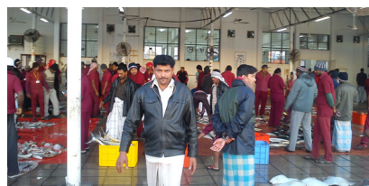
Figure 3.1 One of the fish landings in the United Arab Emirates during the conduct of fish survey/assessment.

A GCC co-operative comprehensive management plan of the Kingfish population in the waters of Arabian Gulf and Sea of Oman for a sustainable Kingfish stock management by regulating the fishing activities and its areas.